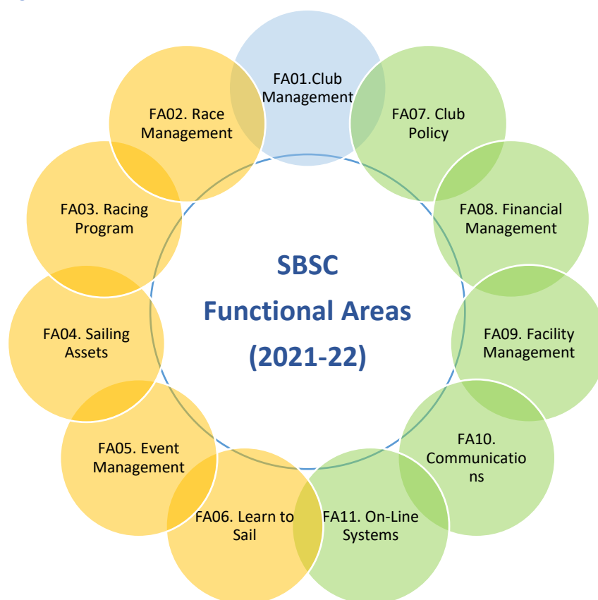
Figure 1. SBSC Organizational Structure 2021-22

Events, On-Line Systems and Communication in 2020/21 is also now divided into three separate areas in 2021-22.